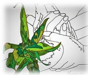
Me kealoha pumehana e Kūpuna mā