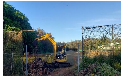
The clearing of 50 years of rubbish!

The next Hawaiian Civic Club of Wahiawā monthly meeting will be held on March 9, 2022. In compliance with CDC safety guidelines for C - 19, our meeting will be Virtual beginning at 7 pm. Windows open at 6:30 for membership kūkākūkā. Aloha! * *The next scheduled 3rd Saturday Kukaniloko Community Clean-up Day is on...March 19, 2022, from 9 am - 12 noon. Mahalo.