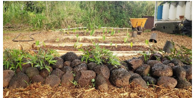
Mid- January replanting of huli kalo and 'uala