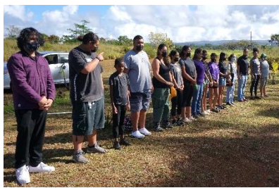
Mahalo to the Nānākuli High School Ambassadors for their valuable support this day. Ke Akua Pū. Eō mai lā, Eō

02.19.2k22... 3 rd Saturday MAHALO NŌ... EŌ