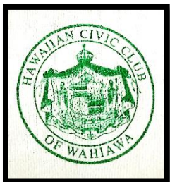
Established November 10, 1960